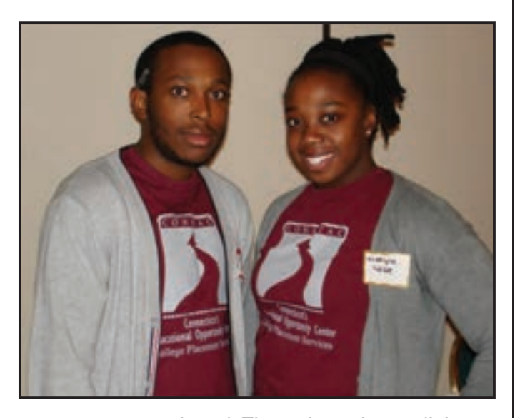
shared. Throughout the cordial two day conference, presentations and discussions were facilitated

ter as details of favorite hobbies and interesting experiences were