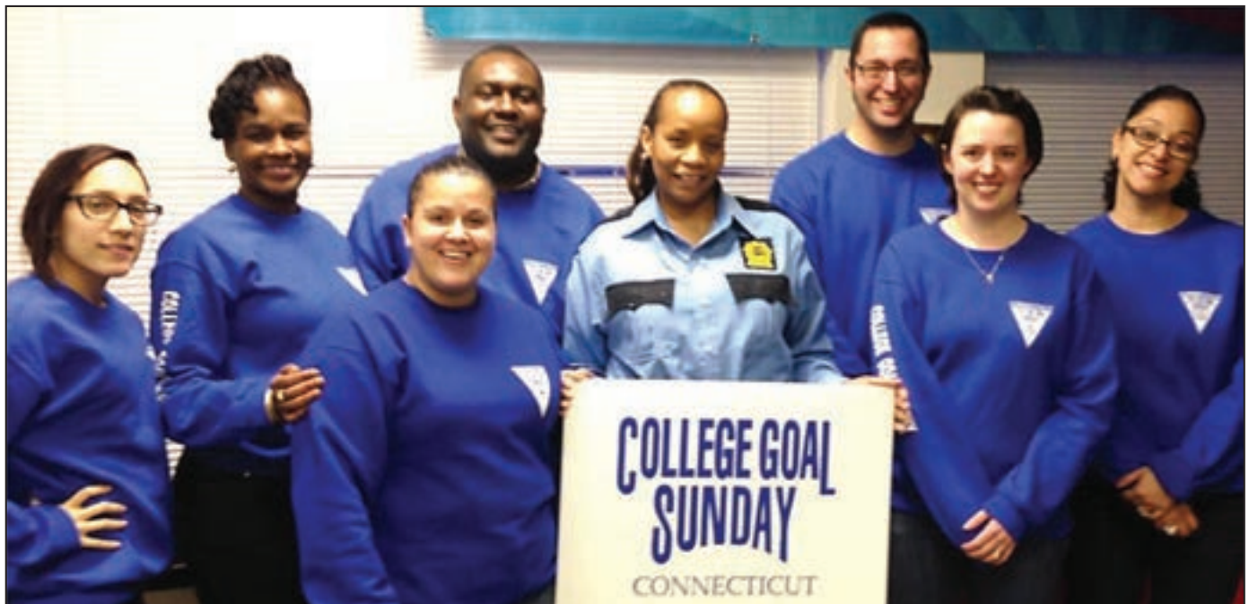
Photo Below: Volunteers at the Meriden Center of Middlesex Community College

CGS event every year, as staff and counselors volunteer their time to assist in creating a well-organized and resourceful experience for students and families.