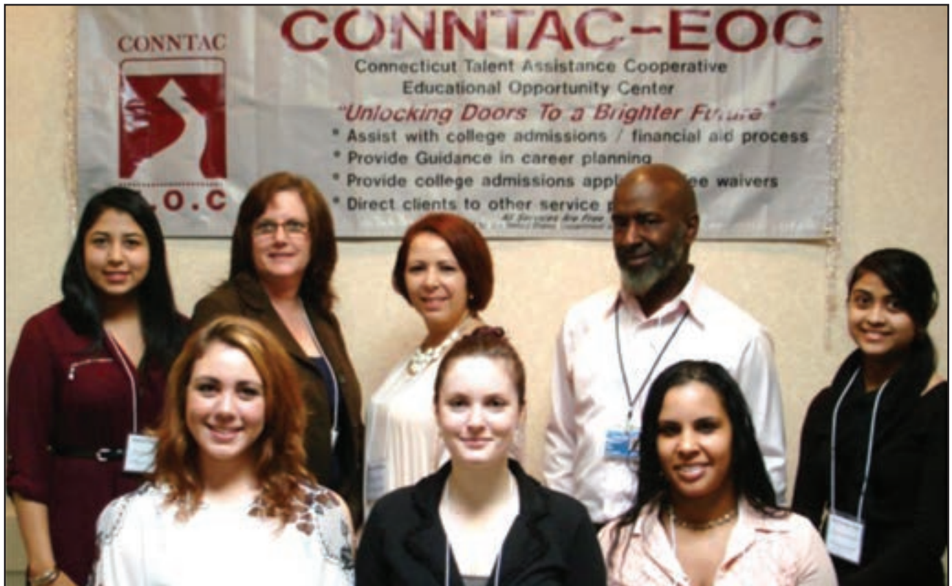
Photo Above: 2014-2015 CONNTAC Inc. Scholarship Recipients